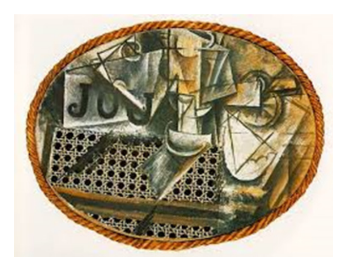
Fig. 1: Pablo Picasso, Still Life with Chair Caning, 1912, oil on oil-cloth over canvas edged with rope, 29 x 37 cm (Musée Picasso)

explained by H. H. Arnason as referring to the French newspaper Le journal, among the scattered objects on the coffee table, also a short of jouer (to play in French).