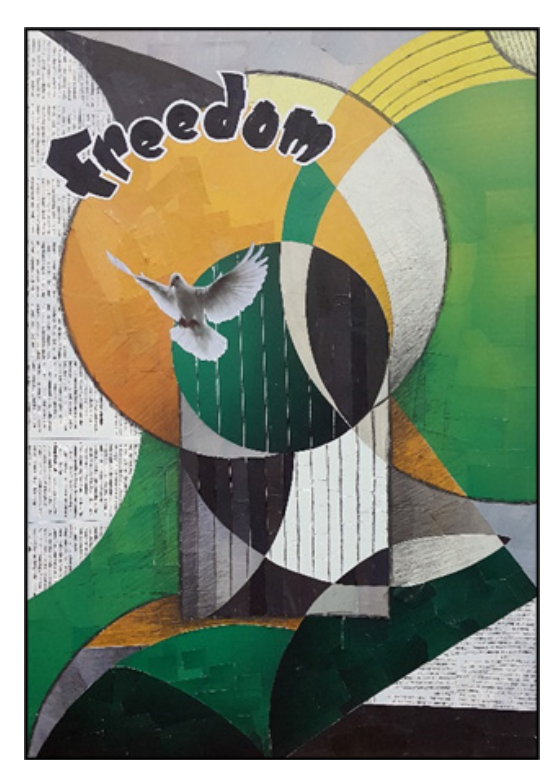
(Freedom) Student No.5-Art Education Course-SCD-2017