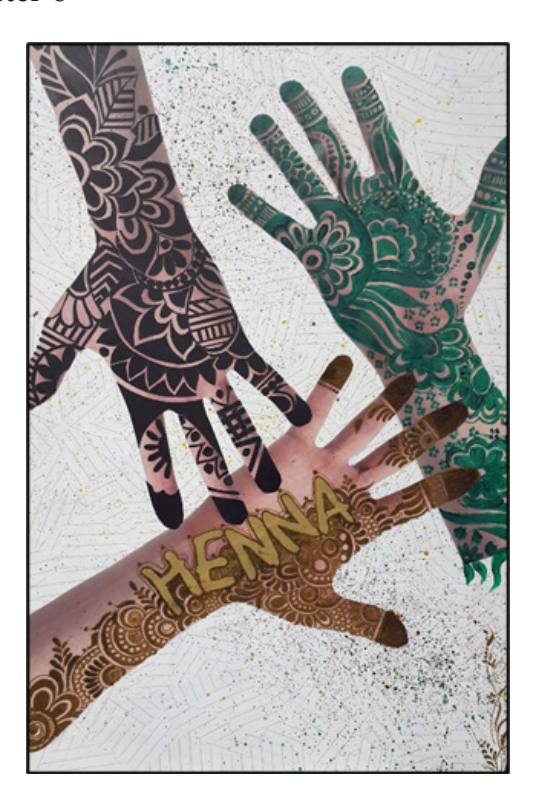
(Henna) Student No.6-Art Education Course-SCD-2017