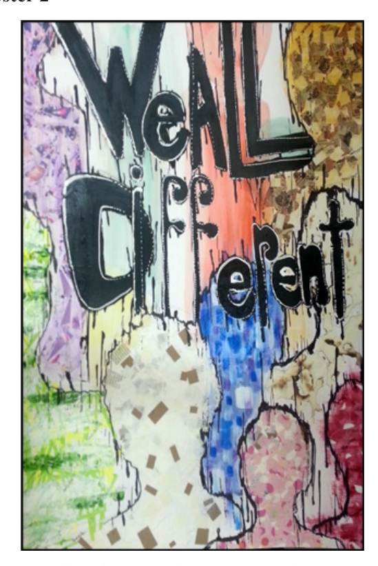
(We Are All Different) Student No.2-Art Education Course-SCD-2017