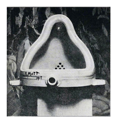
Fig. 3: Marcel Duchamp, Fountain, 1917, Philadelphia Museum of Art, USA.

Conceptual Art, as a movement, began in the 1960s, following Marcel Duchamp's bold thoughts (figure 3). The sensibility is no more directed to the appearance of things, but to the communication of meanings. Here the spectator is to be engaged in pondering what the work says rather than how it looks. "In this context the written word can be as important as the visualization" as Mary Acton says (Acton, 2004, p. 62). By this she means that, writing is a part of the artist's expression and the viewer's engagement.