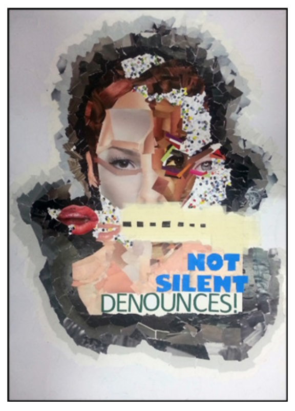
(Not Silent) Student No.1-Art Education Course-SCD-2017