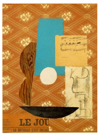
Fig. 2: Pablo Picasso, Guitar, Sheet Music and Wine Glass, 1912, pasted papers, gouache and charcoal on paper, 47.9x 37.5 cm, McNay Art Museum, San Antonio, Texas.

The synthetic phase of cubism was Picasso's and Braque's answer to the vagueness of the analytical phase. They decided to build their pictures around easy recognizable objects, but keeping them as concise as possible, following the idea that less can ever be more (Lambert, 1981, p. 9). Instead of carefully and skillfully painting the objects they pasted the real pieces. It is also called Collage Cubism. Texts, whole words, few letters or numbers are also added (fig. 2)