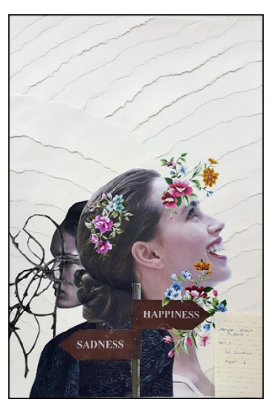
(Happiness/Sadness) Student No.8-Art Education Course-SCD-2017