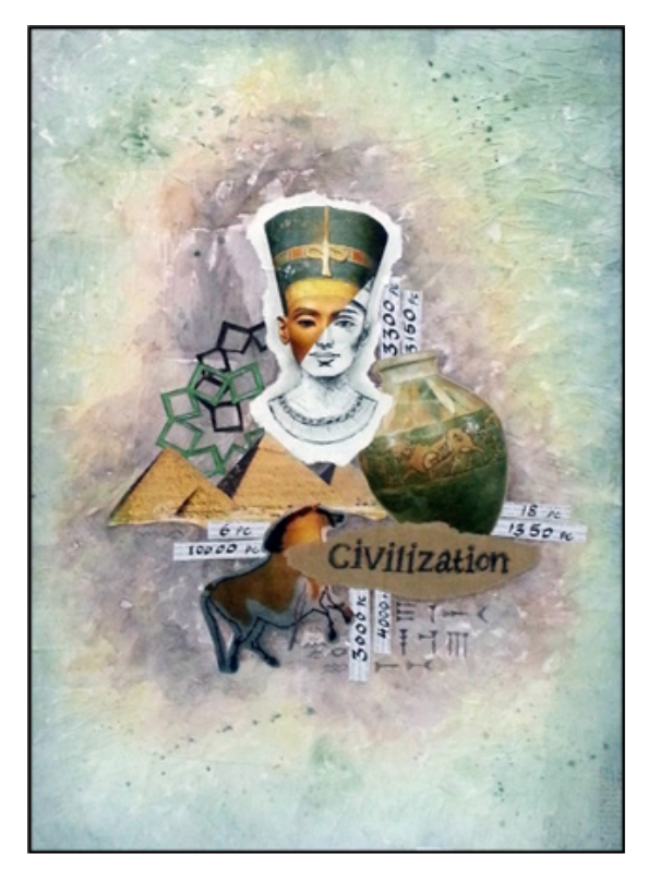
(Civilization) Student No.3-Art Education Course-SCD-2017