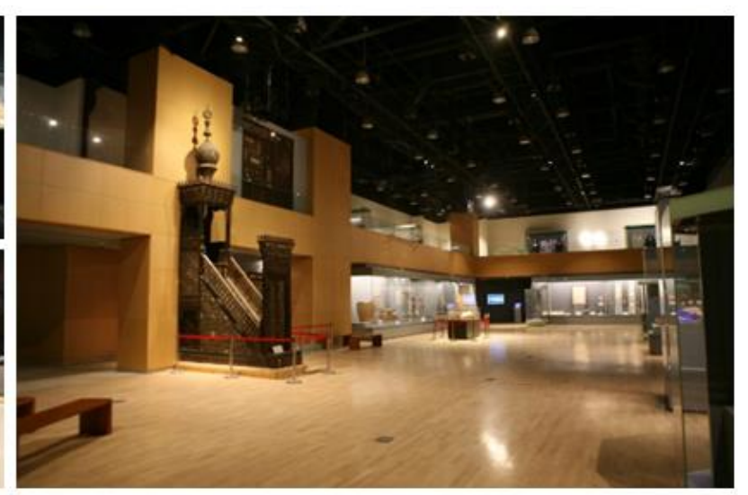
Figure 4 shows National Museum of Egyptian Civilization lighting system

emotionalization (Wang et al., 2019). These four factors were reflected in the lighting design in NMEC, especially in the mummies hall which includes 20 royal mummies from the 17th to 20th dynasties. Lighting in the mummies hall offers a unique experience for visitors that allows them to explore the world of mummies and their details. It evokes emotional responses that make the experience unforgettable.