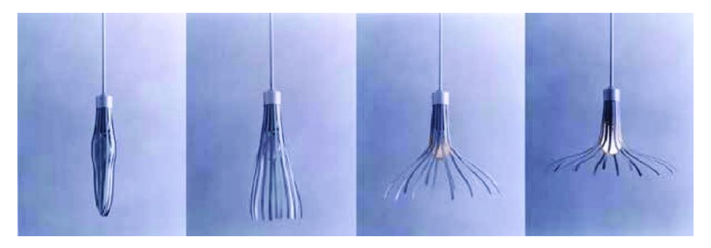
Figure 3 shows Hanabi lamp

Museum lighting design considers four factors: spatialization, visualization, optical engineering, and